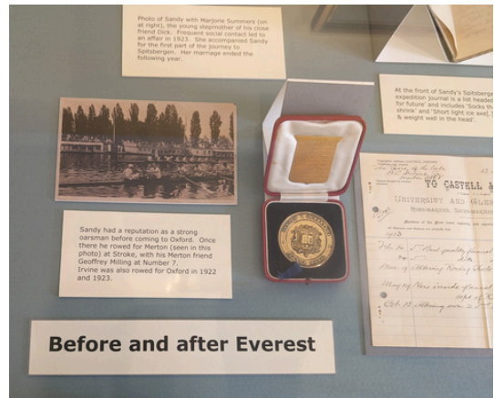
MERTON COLLEGE'S HISTORIC LIBRARY & SUMMER 2024 EXHIBITION